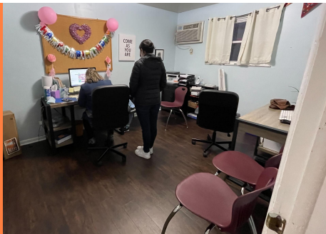
This former bedroom is the community care office with 2 desks and chairs for neighbors