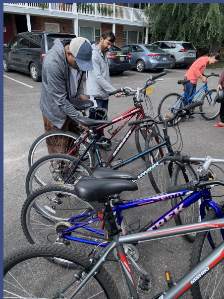
Several neighbors try out the bikes from Franklinton Cycle Works to choose which one fits best