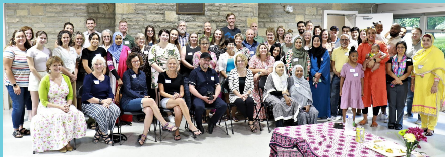
Volunteers who attended the 2023 appreciation dinner at Whetstone Shelter

From Day One, volunteers have given their time to welcome, teach, serve, assist, drive, donate, fix-up, create, play, and more. We now count 150 people in this valuable group! Our volunteers work hard to empower our neighbors and to make Columbus a better place to live. Thank you!