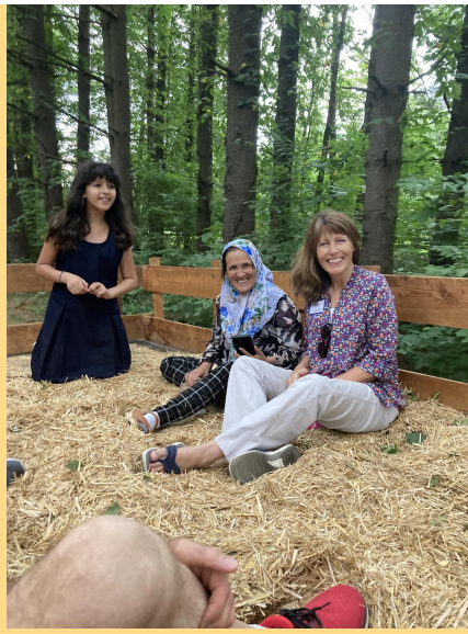
Neighbors enjoying a hayride at the John Beltz Retreat Center