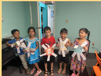
Above: K-2 students from the first week of camp show off their art work.