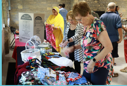
Shopping the lovely creations made by the Riverview sewing group.